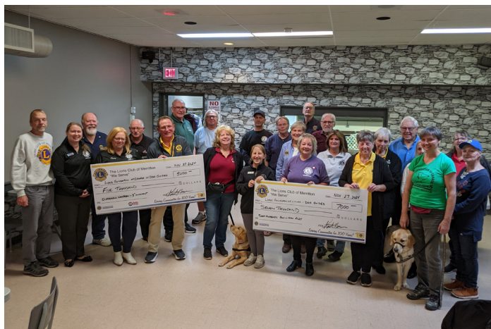
Merriton Lions Club