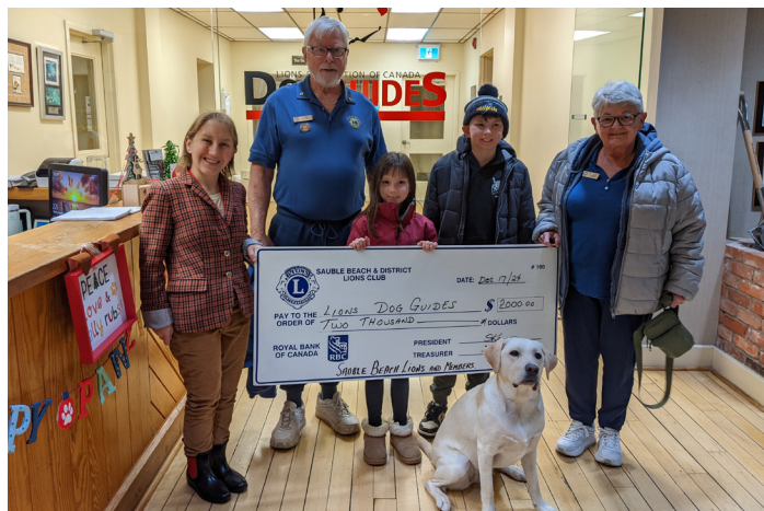
Sauble Beach and District Lions Club