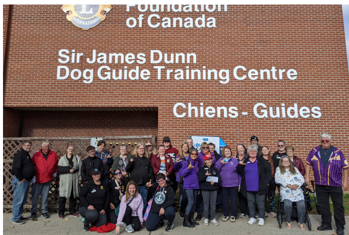
East Peterborough Lions Club