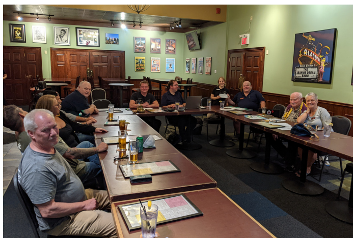
Kitchener Pioneer Lions Club